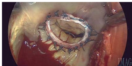
Figure 2. Postoperative image.

The circuit was initially primed with 1,000 mL of lactated ringers (B Braun, Irvine, CA). After the chest was open and the heart was exposed, the patient was systemically heparinized with 20,000 units of heparin, with a target activated clotting time (ACT) of > 480 s. Both antegrade and retrograde cardioplegia were used for myocardial protection. Retrograde autologous prime and antegrade autologous prime were performed on the patient and 700 mL of prime was removed. At that time 12.5 g of 25% albumin, 25 g of mannitol, 5,000 units of heparin, 50 meq of sodium