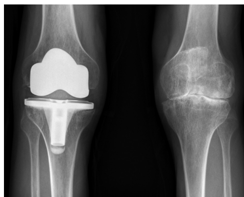
Figure 4. Left knee joint involvement in a hemophilic patient after recurrent bleeding episodes. The right knee had already required a total knee arthroplasty 5 years ago.

The objectives of treatment are to stop the hemarthrosis or to control them quickly and to avoid secondary synovitis. Once synovitis has developed, which is inevitable, the aim is to treat it as early and aggressively as possible. Confirmation of the diagnosis is important and can be achieved by ultrasound or MRI (Fig. 2). Sometimes standard conservative measures,