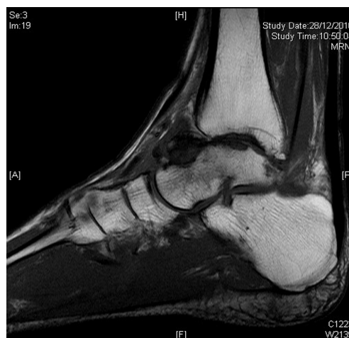
Figure 3. Hemophilic arthropathy of the ankle showing subchondral sclerosis, narrowing of the joint line and subchondral cysts (MRI).

supervised period of physiotherapy as rehabilitation is paramount to halt the development of synovitis. The duration of physiotherapy will depend on the time required to regain full range of movement and muscular strength. Re-bleedings during the recovery period should be avoided as much as possible. Patients must be seen every 3 months at the outpatient clinic for close and careful assessment [4].