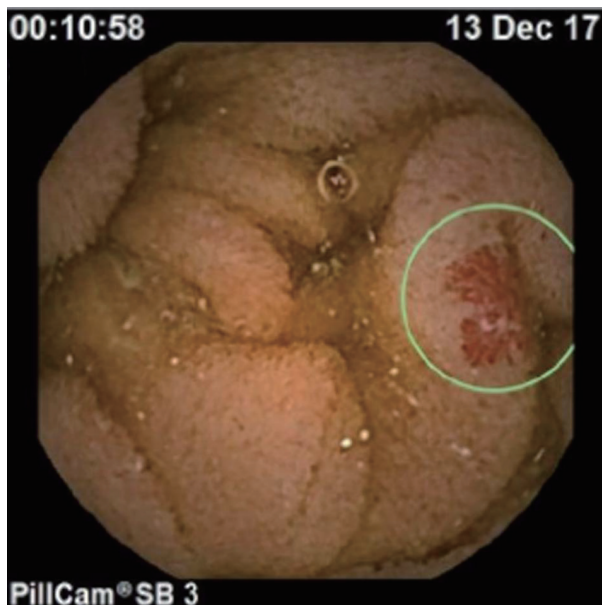
Figure 2. Capsule endoscopy revealed angiodysplasia at the proximal part of the small bowel.

Other comorbidities include asthma and longstanding type 2 diabetes with associated painful neuropathy, precluding the use of thalidomide. The multitude of hospital appointments and procedures had a significant negative impact on his career and quality of life, though he managed to remain in full-time employment.